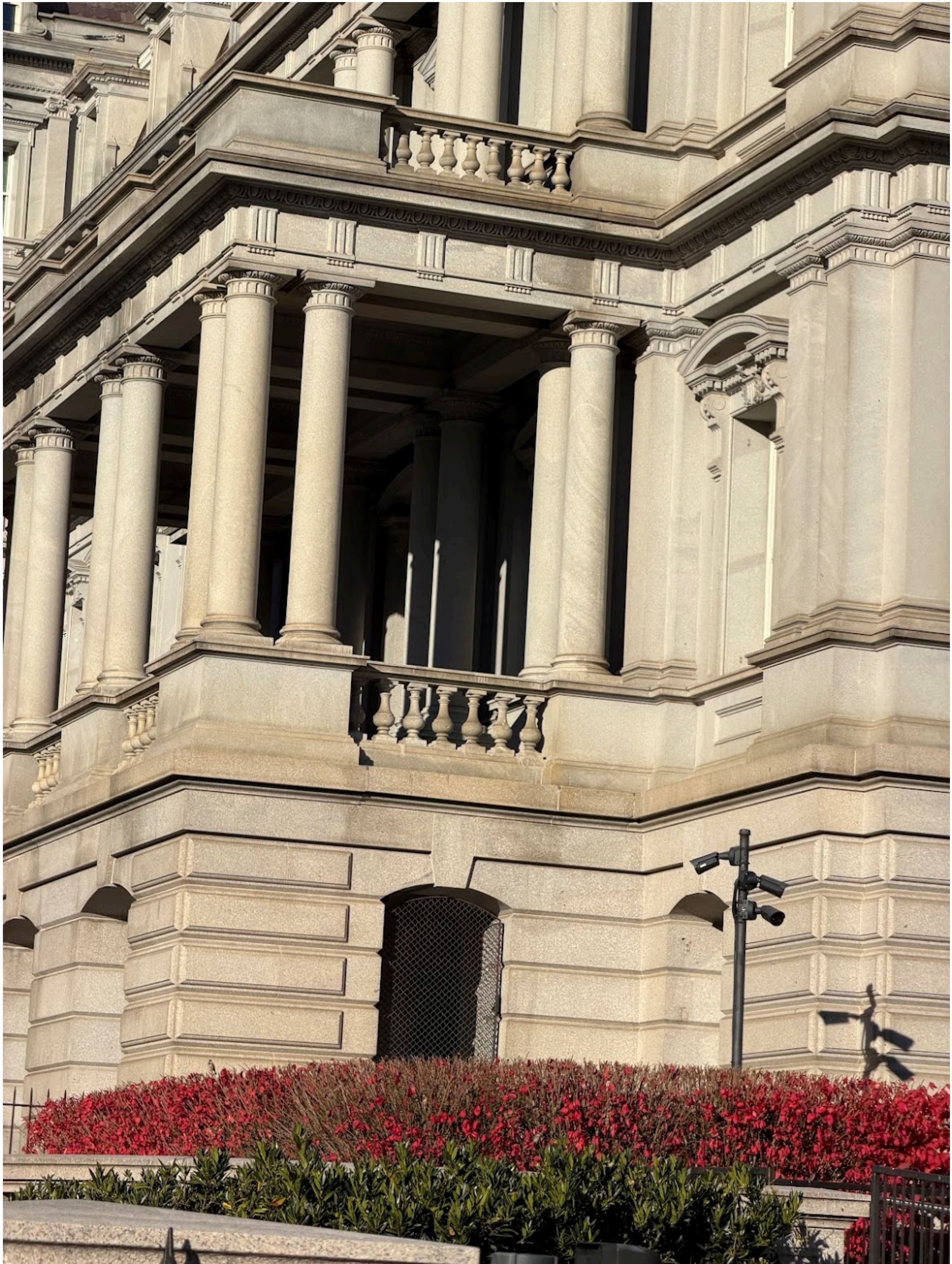
Image 1: Close up photo of the EEOB, November 2025