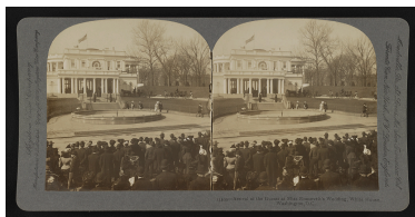
Arrival of the guests at Alice Roosevelt's wedding, White House, Washington, D.C., in 1906.

The association added that historical artifacts that were located in the East Wing "have been preserved and stored."