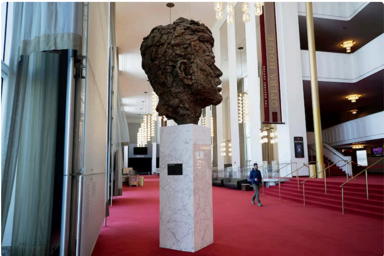
A bronze sculpture of President John F. Kennedy is displayed in the John F. Kennedy Memorial Center For The Performing Arts, Feb. 2, 2026 in Washington.

Since Trump's takeover of the Kennedy Center, several high-profile artists and shows have canceled appearances , including the Broadway show "Hamilton." Opera star Renée Fleming resigned from her role as artistic adviser at large.