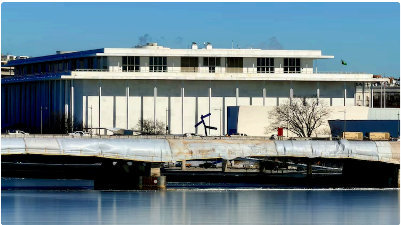
A view of the Kennedy Center along the Potomac River in Washington, February 2, 2026.

"It's a total outrage," she told ABC News in a phone interview. "This is just shutting it down because he has to cover up that he's run the place into the ground."