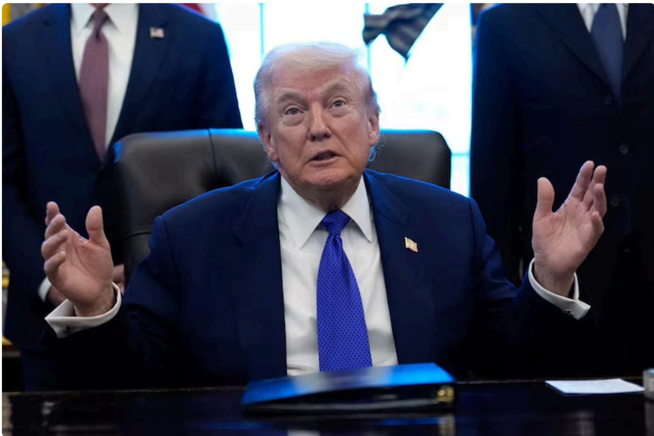
President Donald Trump speaks in the Oval Office at the White House, February 2, 2026.

"The steel will all be checked out because it'll be fully exposed," he said.