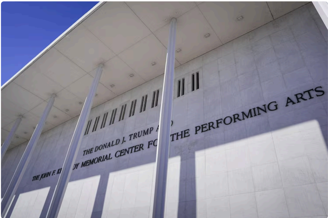
The John F. Kennedy Memorial Center for the Performing Arts in Washington, February 2, 2026.

"Once again, Donald Trump has acted with total disregard for Congress. The Kennedy Center is congressionally funded, and Congress should have been consulted on any decision to shut down its operations or undertake major renovations, especially for a two-year period," Beatty said.