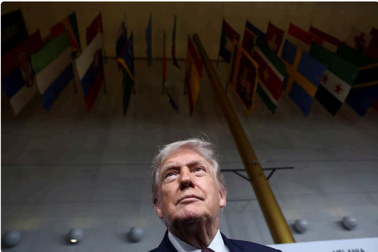
Donald Trump attends the premiere of the documentary film "Melania" at the Kennedy Center in Washington, D.C., January 29, 2026.