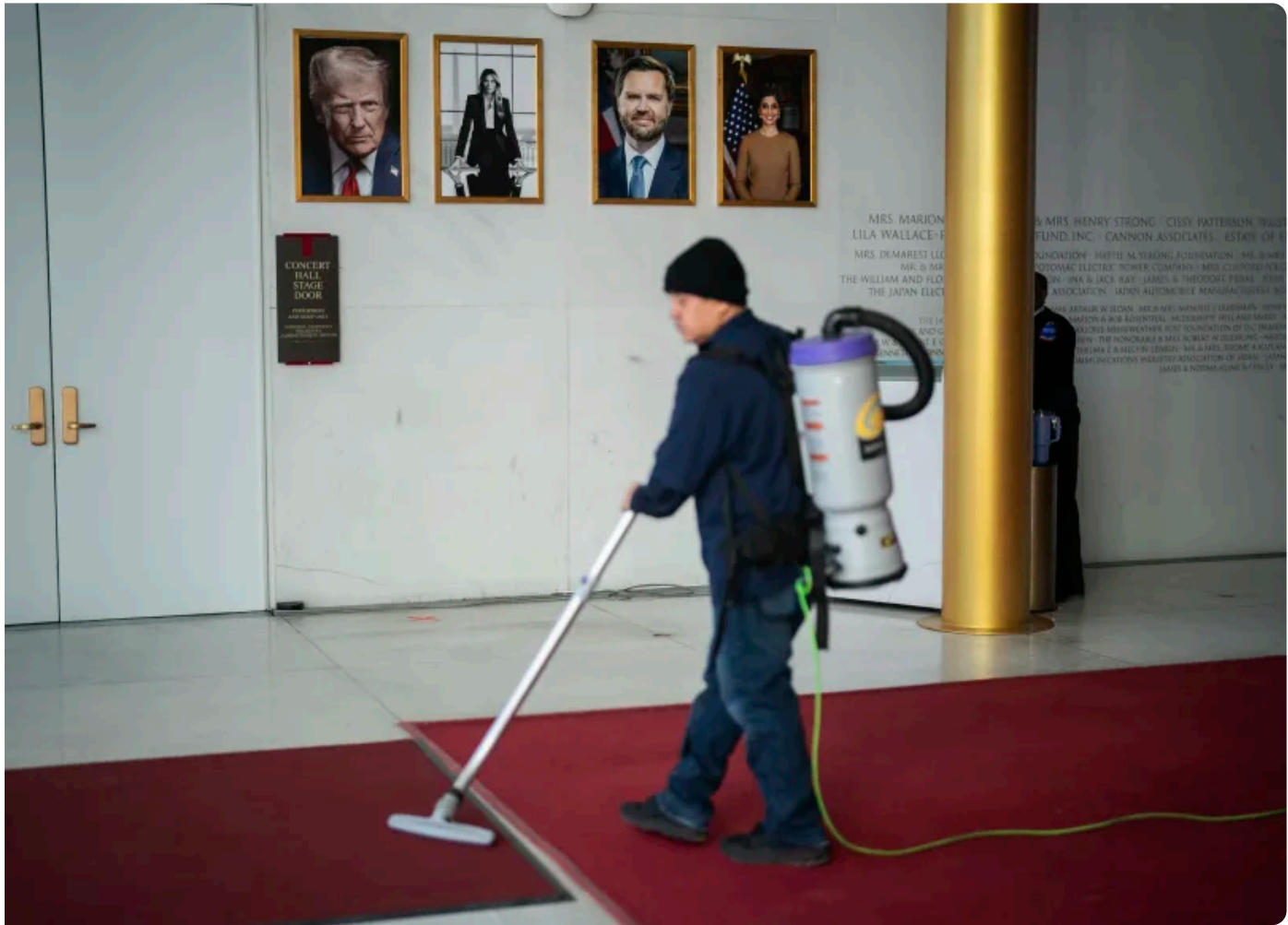
Portraits of President Donald Trump, first lady Melania Trump, Vice President JD Vance and second lady Usha Vance are seen inside the Hall of Nations at the John F. Kennedy Center for the Performing Arts in Washington, DC, in February.

He subsequently suggested that the project could be dramatic — a demolition effort short of a teardown, but one so severe that it would leave the Washington building’s steel “fully exposed.”